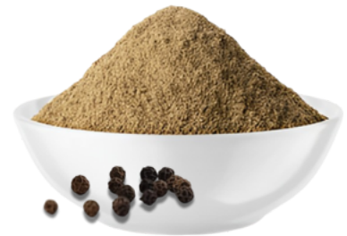
Black Pepper Powder