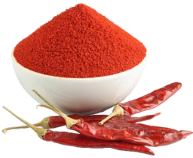
Red Chilli Powder