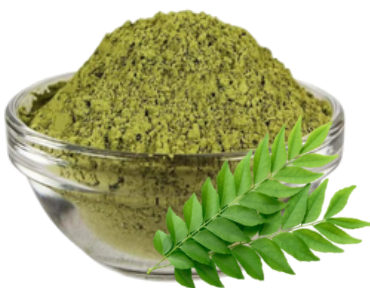
Curry Leaf Powder